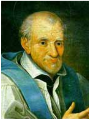
Saint Vincent de Paul

A Brief History of the Society as written in our website: St. Vincent de Paul was the inspiration if not the founder of the society that bears his name. He was born in the late 16th century in France, became a priest for perhaps the wrong reasons, but then allowed God to transform him into a champion for the poor and oppressed.